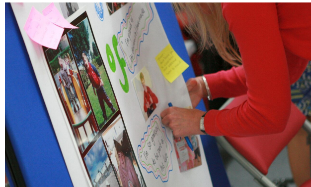
The PACC Conference Mad, Sad, Glad wall