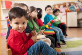
Shrewsbury, Oswestry, Ludlow

*This activity operates on selected home match days only https://actioconsortium.wixsite.com/website/stfc-in-the-community