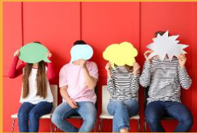
Shrewsbury & Online

Social Activity & Development Workshops with Autism West Midlands Variable Sessions Available Suitable for 11-17 year olds