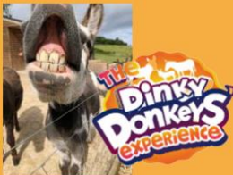
Pulverbatch, near Shrewsbury

https://actioconsortium.wixsite.com/website/action-for-children